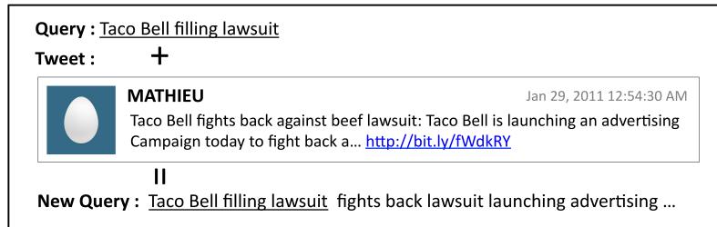
Fig. 2. New query = original query + relevant tweet by user feedback.

detect a relevant tweet without much effort. Finally, we combine the selected tweet with the original query to create a new query for retrieving a new set of tweets. Figure 2 presents an example of the original query ( Taco Bell filling lawsuit ), its relevant tweet, and a new query.